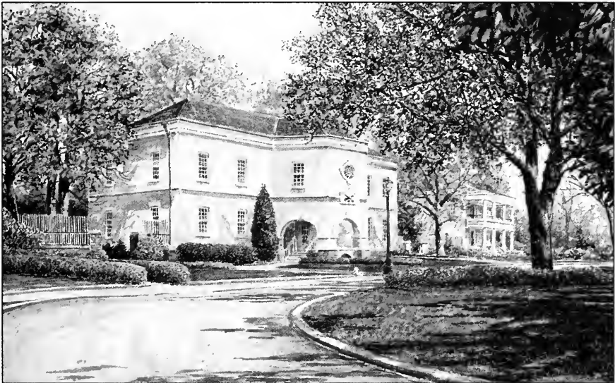
Historic Payne Hall (left) and Rains Hall